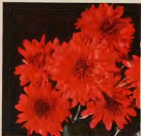
AUTUMNSONG. 60c each; 3 for $1.50

6 Summer MUMS A selection that always beats the frost. All early and dependable. 6 Sure-to-Bloom Plants $2.80 (1 of each pictured)